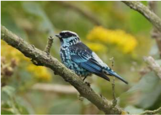
Beryl-spangled Tanager

traffic in the south part of the city. A remarkable eleven species of colorful tanagers (all formerly in Tangara but now separated into several genera) occur here, although we would have to be quite lucky to see all of them in a single day. Hummingbird feeders in a highland clearing attract quite a dazzling array of species, among them Golden-bellied Starfrontlet, Collared Inca, Tourmaline Sunangel and Sparkling Violetear. The humid montane forest in this reserve is steep, but the trail up into the prime birding area is not long and there should be good birding everywhere in this area. This private reserve also is notable for mixed-species flocks that roam these slopes and, with luck, we may encounter one or even several