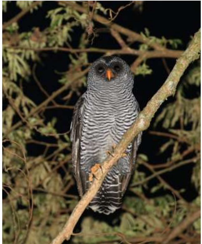
Black-and-white Owl

Two relatively small private reserves are located near the little town of Santa María and both offer excellent birding opportunities. The area also is well known to butterfly aficionados for its high diversity of butterflies. We plan to divide our time between these two reserves, spending two days here. Among many bird possibilities are Black-and-white Owl, White-tipped Sicklebill, Gray-chinned Hermit, Blue-fronted Lancebill, White-chinned Jacamar, Chestnut-eared Araçari, Lined Antshrike, Northern Slaty-Antshrike, Rufous-winged Antwren, Crested Spinetail, Black-billed Treehunter, Black-and-white Becard, Dusky Antbird, White-crowned Manakin, Striolated (formerly Striped) Manakin, Speckled (formerly Spotted) Nightingale-Thrush, Andean Cock-of-the-rock, Turquoise Tanager and Orange-bellied Euphonias. Several rarities also occur in these reserves, among them Spot-winged Parrotlet and Short-tailed Antthrush, although we'll need some luck to see any of them. Flowering trees here also attract a number of hummingbirds including Glittering-throated Emerald, Green-bellied Hummingbird and Golden-tailed Sapphire, and we often see Fasciated Tiger-Heron along the stream below the town.