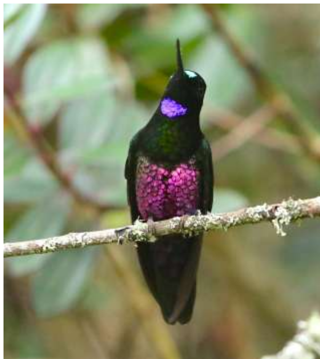
Blue-throated Starfrontlet

February 18, Day 3: Early Morning Start to the Eastern Andes Above Bogotá. Today we plan to visit the large and spectacular Chingaza National Park located in the mountains east of Bogotá. Elevations will range from about 8,600 feet at Bogotá to possibly as high as 12,000 feet, although we may not get above 11,000 feet if it's foggy. This beautiful park serves as a watershed and water source for the city of Bogotá and, as such, preserves a wonderful cross section of high-elevation humid forest and also distinctive páramo vegetation, which is found above tree line. Approaching the park, the road initially passes through several kilometers of montane forest and later enters open páramo dotted with Espeletia spp. (frailejón), a group of fuzzy-leaved Asteraceae (sunflower family) that are taller than the grass covering the region and having a distinctive appearance, with rosettes of leaves near the upper part of the plant. A sampling of birds