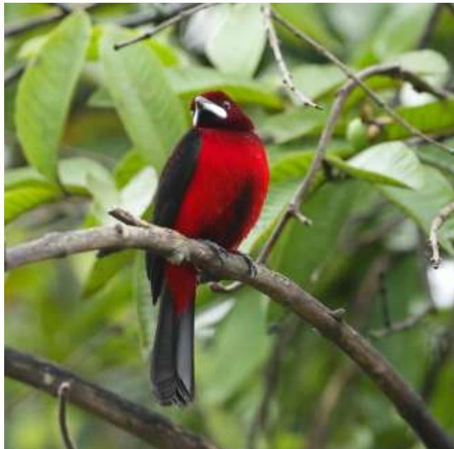
Crimson-back Tanager

dove; Pauraque; Crested Owl; Orange-chinned Parakeet; Blue-headed Parrot; White-collared, Band-rumped and Short-tailed swift; Rufous-breasted Hermit; Long-billed Hermit; Stripe-throated Hermit (split from Little Hermit); Blue-chested hummingbird; Crowned Woodnymph; White-tailed Trogon; Rufous and Broad-billed motmot; Rufous-tailed Jacamar; Collared Araçari; Channel-billed (formerly Citron-throated) Toucan; Yellow-throated Toucan; Cinnamon and Lineated woodpeckers; Plain Xenops; Wedge-billed, Cocoa and Streak-headed woodcreepers; Checker-throated Antwren; Chestnut-backed Antbird; Yellow-crowned Tyrannulet; Sepia-capped Flycatcher; Long-tailed Tyrant; Great-crested Flycatcher (northern winter); Dusky-capped and Panama flycatcher; Masked and Black-crowned tityra; One-colored Becard; Purple-throated Fruitcrow; Black-bellied Wren (common); White-breasted Wood-Wren; Red-eyed Vireo; Gray-headed, White-shouldered, Crimson-backed, Flame-rumped (Lemon-rumped), and Plain-colored tanagers; Thick-billed and Fulvous-bellied euphonias; Yellow-tufted (Black-faced) Dacnis; Orange-billed Sparrow; and Chestnut-headed and Crested oropendolas. The list is long and we'll likely not see all of these species but there are sure to be some exciting birding moments in this lovely area. Most of our birding will be on a level road.